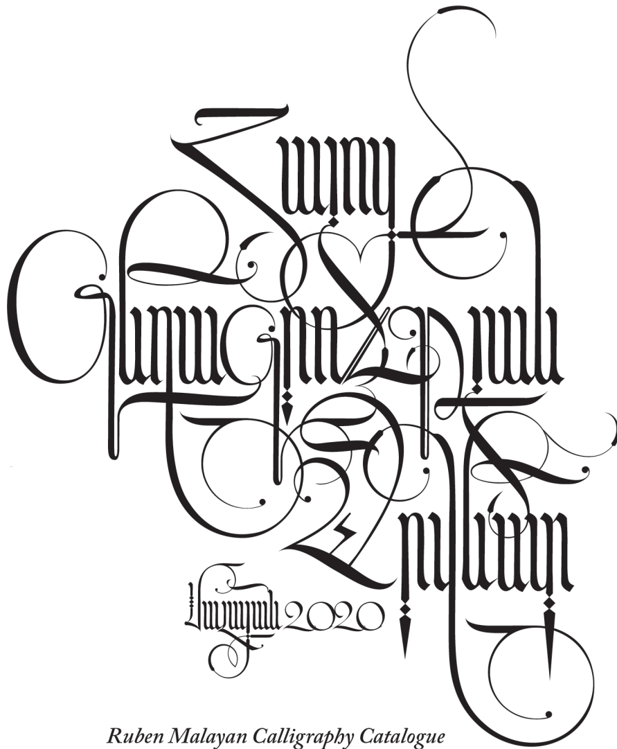
Ruben Malayan Calligraphy Catalogue